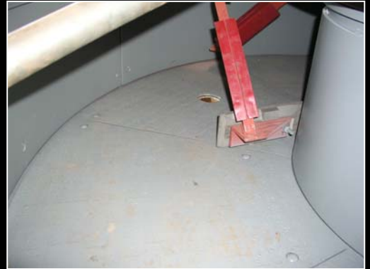
AR Steel Plates

For very abrasive batch materials or to extend wear life, TEKA mixers can be lined with Chill-Cast Tiles or Hard-faced steel wear plates that are coated with chromium carbide.