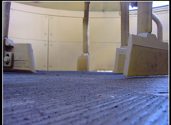
Hard - faced Steel Plates