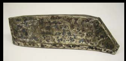
Hard - faced